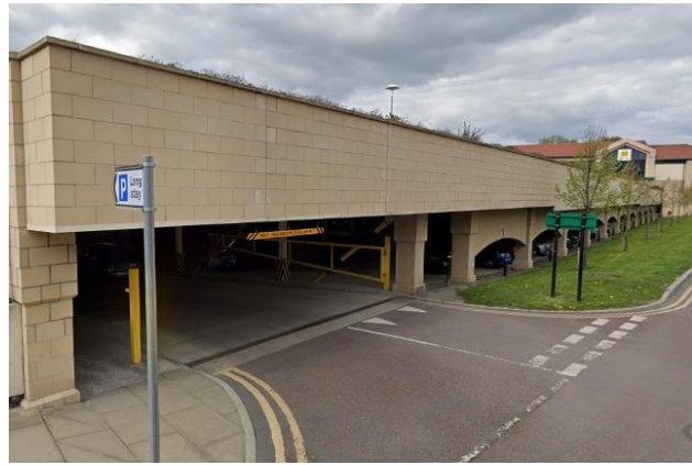
St James Long stay carpark and Morrison's long stay carpark(underground)