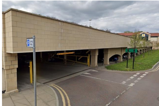
St James Long stay carpark and Morrison's long stay carpark(underground)